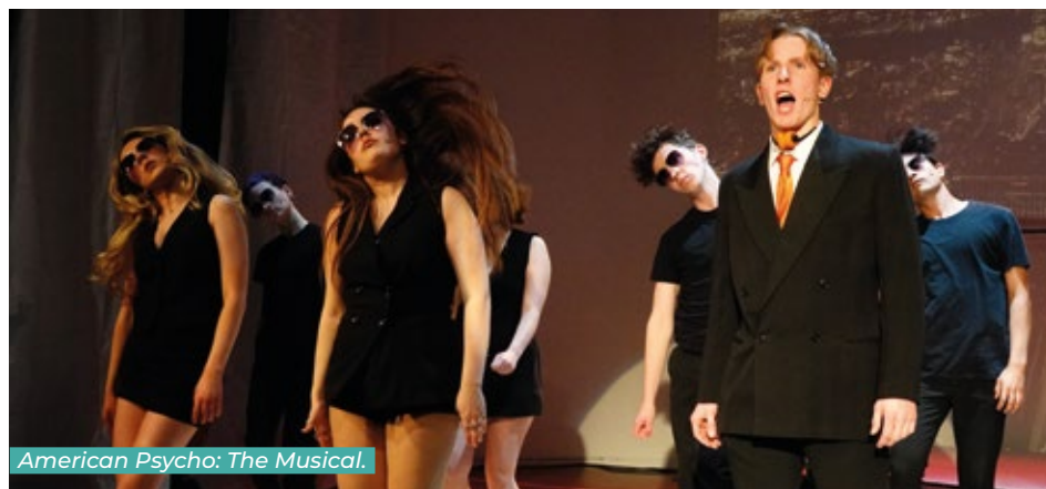
American Psycho: The Musical.

Book by Roberto Aguirre-Sacasa. Music & Lyrics by Duncan Sheik. Based on the novel by Bret Easton Ellis.