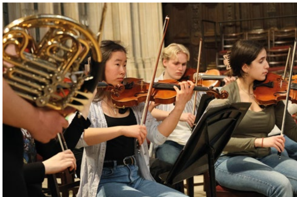
With kind permission of the Master and Fellows, King's College, Cambridge.

Set within the stunning Chapel – renowned for its soaring fan vaults and superb acoustics – the concert provided a rich musical contrast to the College's celebratory variety show at the Corn Exchange in March.